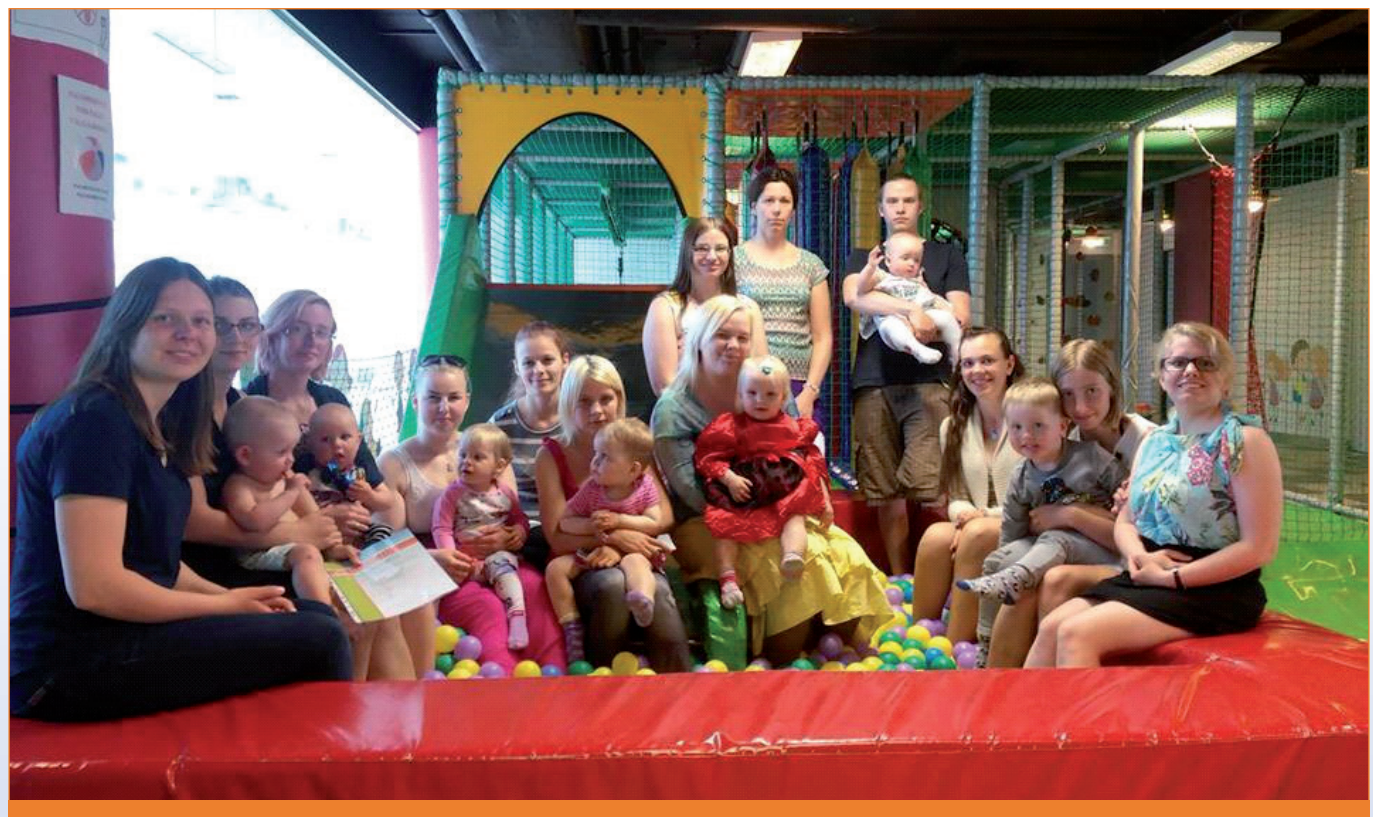
Training set in Pärnu county. Parents appreciate the childcare during the programme.

In their feedback, participants appreciated highly the information regarding learning and labour market possibilities and the availability of support services. Career specialists helped them to analyse their personal abilities, needs and wishes as well as the existence of personal support network. The study visits to upper secondary schools and vocational education institutions were considered especially helpful. They analysed their abilities, needs and wishes, as well as the existence of support. In autumn, organisers monitored participants' further steps in regards with their studies. For that all the participants and schools were contacted.