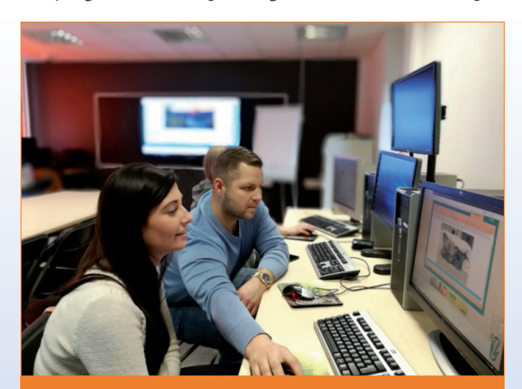
The students of TVTG taking part in IT courses

In their feedback, the students appreciated highly the additional courses created for weaker students. 0-course and levelling courses offered students, especially the ones who had been away for a longer time from formal learning environment, "a softer landing" and gave confidence that they are capable of graduating from secondary school.