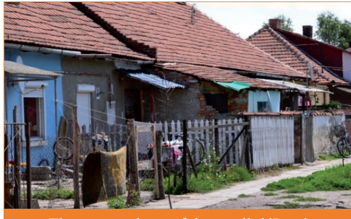
The segregated area of the so called 'Paris'

The project of the Municipality of the City of Békés entitled 'Together for Integration in Békés' is closely re-