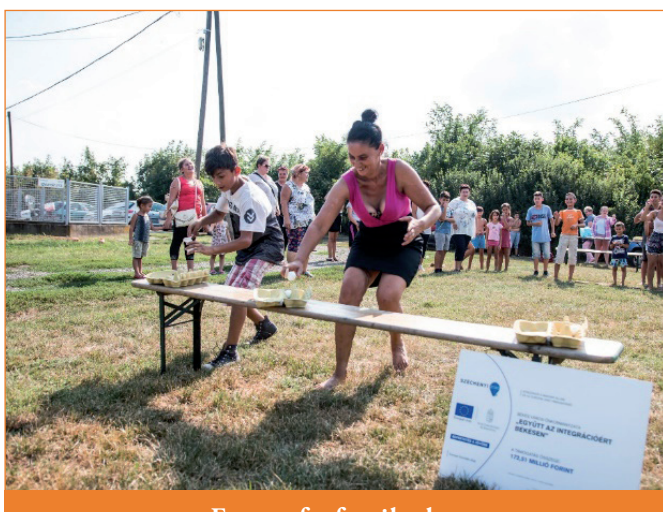
Event of a family day