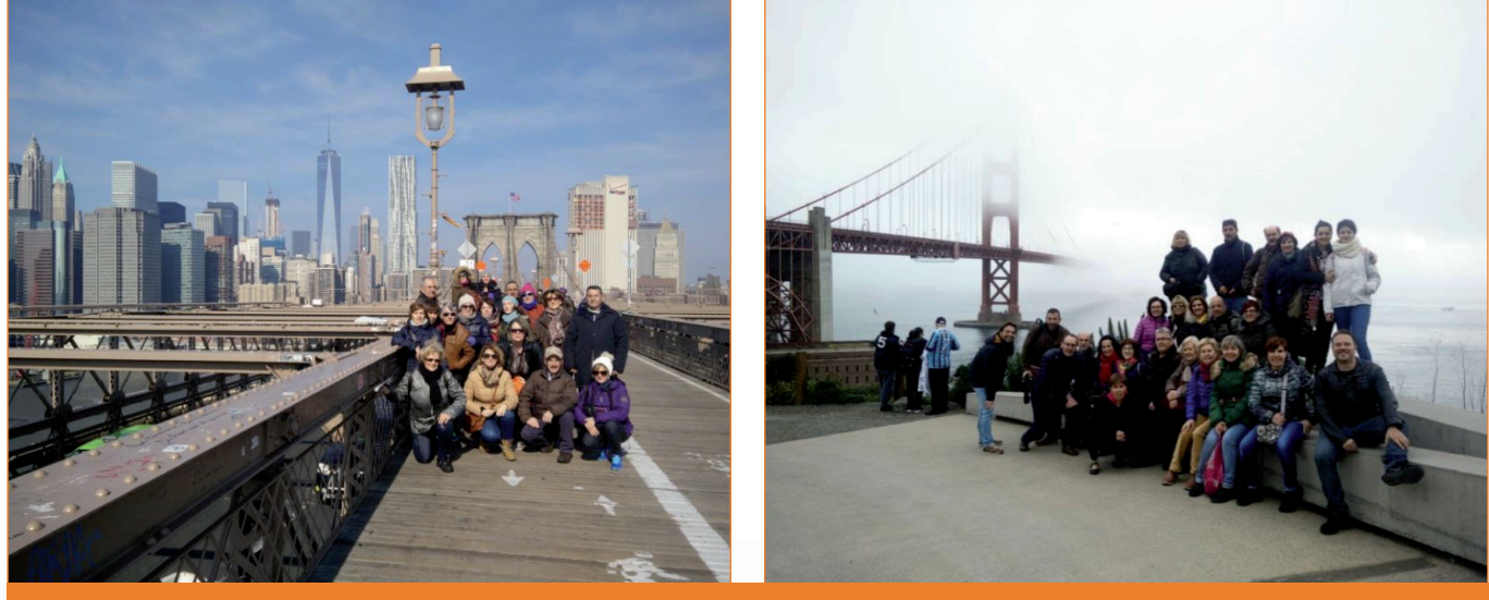
Trip to the United States